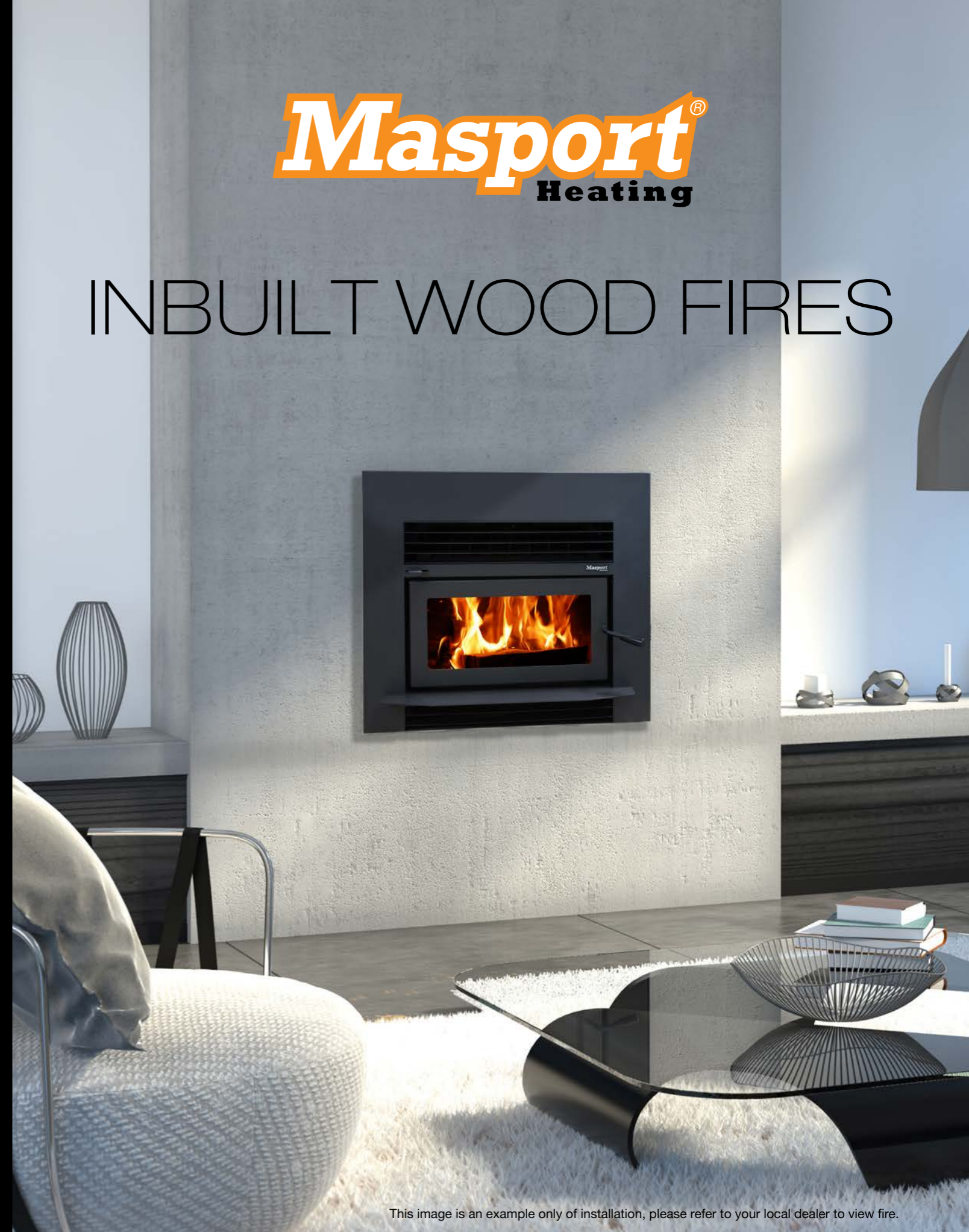
This image is an example only of installation, please refer to your local dealer to view fire.