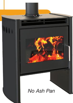
No Ash Pan