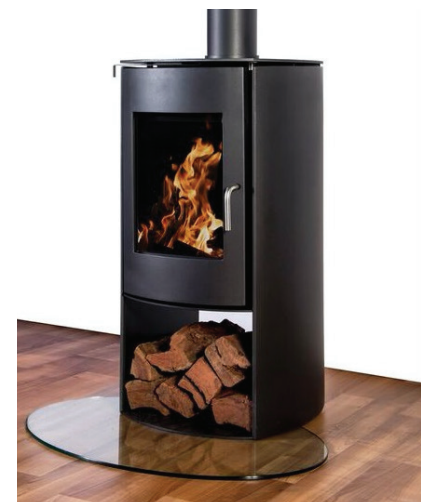
Curved side model